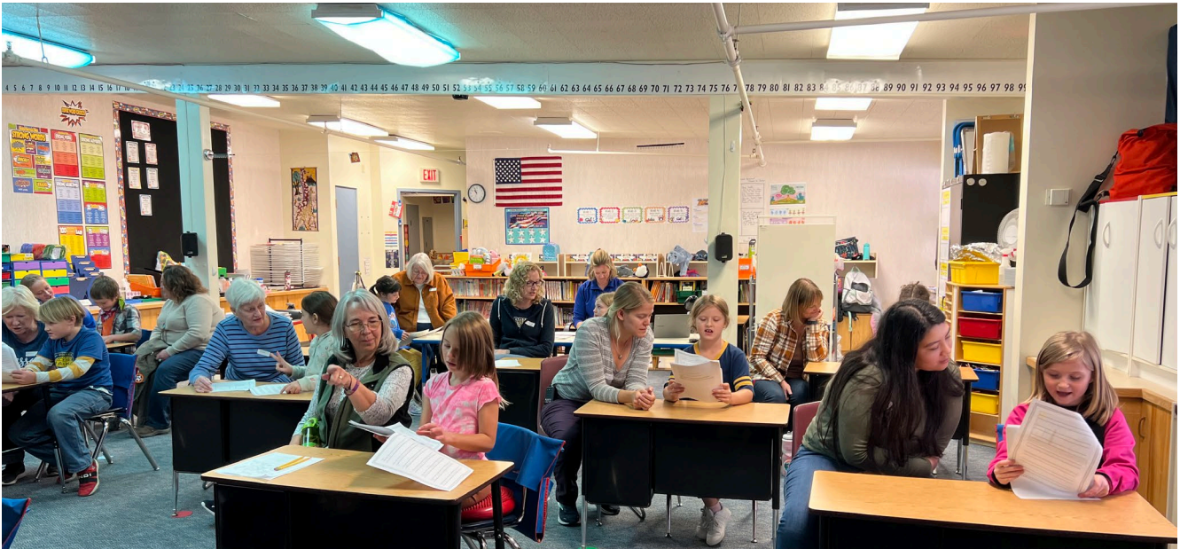
2 nd Grade Students with Bruin Buddies volunteers.